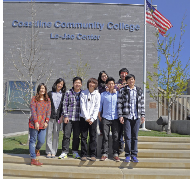
These EBUS students earned a combined total of 190 fully-transferable IGETC college-credits before arriving in the United States to continue working toward completion of their college or university degrees.

Through the EBUS program these students were able to earn their high school diplomas in China while simultaneously studying intensive academic English and earning fully-transferable American college credits before arriving in the United States to complete their college degrees.